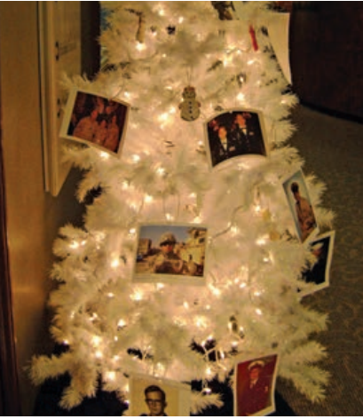
Holiday Honor Tree celebrating past and present military personnel