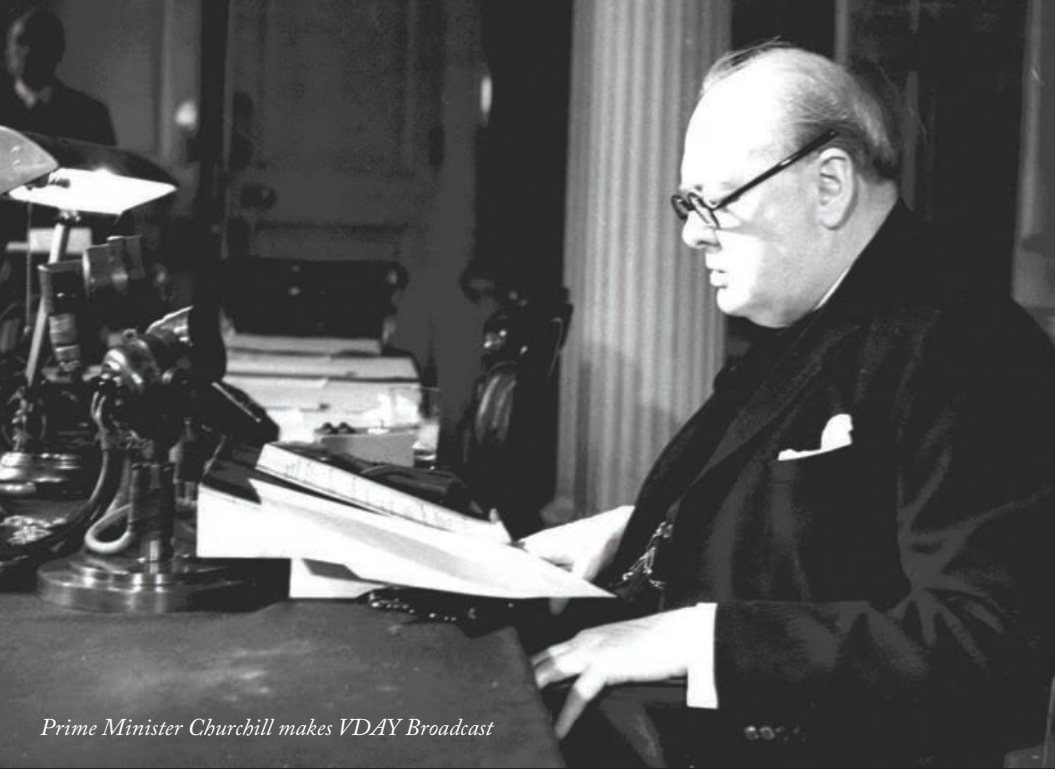
Prime Minister Churchill makes VDAY Broadcast

agreement with the Indian National Congress. With most Conservative MPs supporting their leader, Churchill and others in the India Defence League had little choice but to organize a campaign of opposition among grassroots Conservatives. Up and down the country, Churchill spoke against what emerged in 1935 as the India Bill. He conceded that the provincial legislatures could have more powers, but he ruled out completely the possibility of a role for Indians in the federal government, believing that it would lead to a Hindu state dominated by the elite Brahman caste, in which all minorities, particularly India's Muslims and low-caste untouchables, would be marginalized. The minorities question featured prominently in speeches by diehard Conservatives opposed to the bill. In addressing these humanitarian issues, the India Defense League hoped to avoid the accusation they only cared about British prestige and grandeur. This was a problem for the diehards, not only because of their well-known passion for imperialism, but also because the other main plank of their argument against the bill was that it was not supported by India's native princes. The bill required that these quasi-independent princely