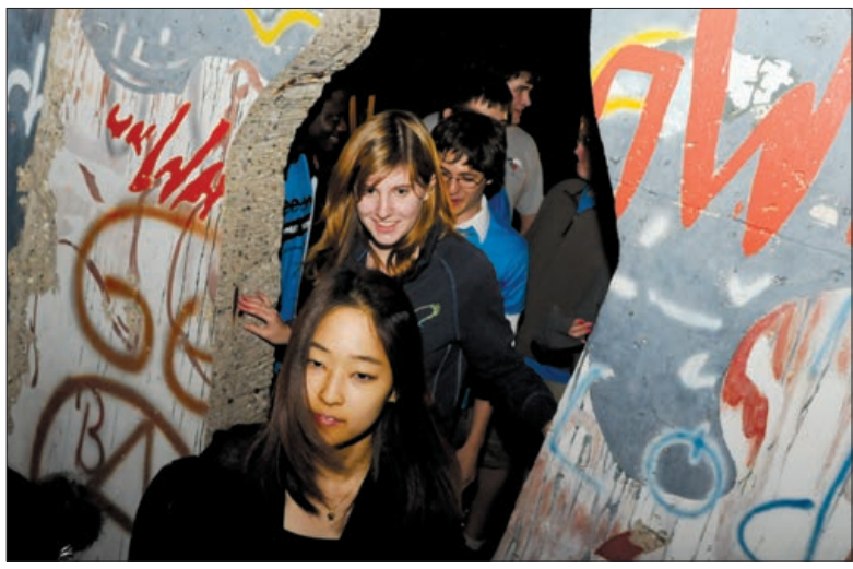
STUDENTS PASS THROUGH THE "BREAKTHROUGH SCULPTURE"