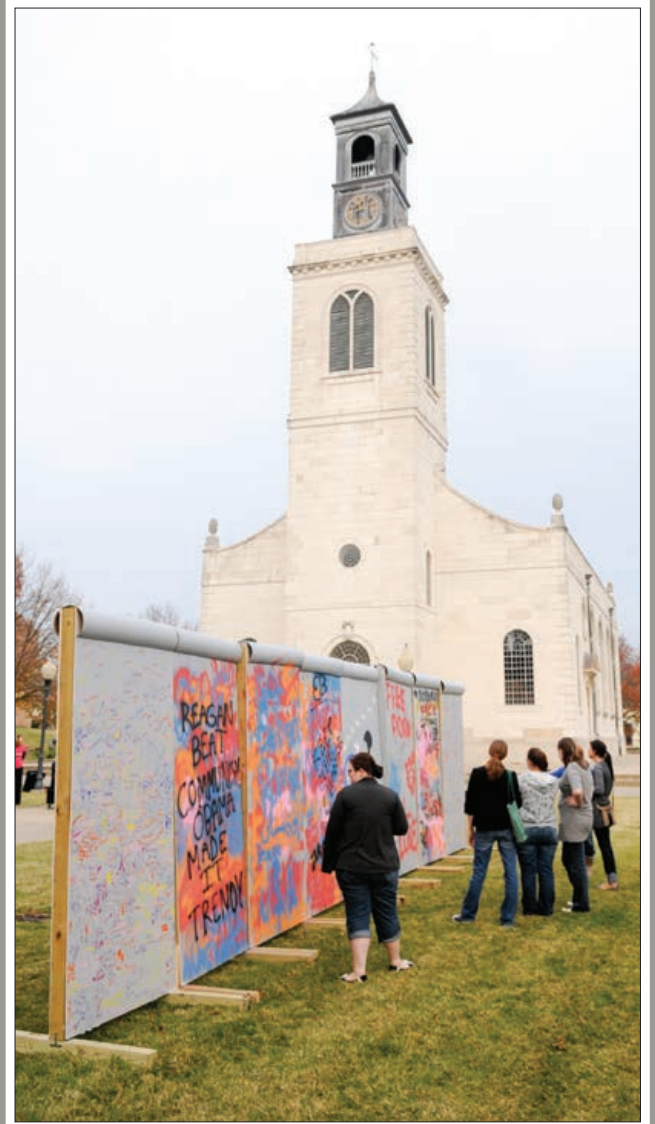
THE REPLICA WALL TAKES SHAPE ACROSS LATSHAW PLAZA

In the seven days before the main event, the replica sections were installed around Westminster's campus, the local community and all of Fulton's K-12 schools. The idea was that people would have the opportunity to paint or write on these sections (appropriately supervised of course) and to make a comment about the nature of freedom or what freedom means to them or simply to write something of their thoughts and feelings about the Cold War. For so many of the students and school children who participated, the Cold War is but a historical memory, something that ended before they were born. This participatory activity worked well in terms of engaging them with the anniversary and, in tandem with the other activities, prompted them to consider its significance. After a week of accruing paint and comments, the replica