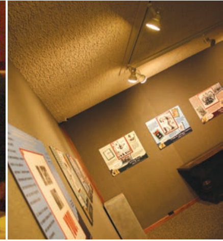
"Dr. Seuss Wants You!" traveling exhibit

We are doing things a little bit differently this year regarding the "Teaching Churchill" Summer Teacher Workshop. Instead of 2½ days, we will have a 1½ day workshop. This new streamlined workshop will focus on promoting one thing—teaching educators how to use Churchill (and the Museum) in the classroom. We will provide tips and tricks as well as the more traditional informational sessions. Given that the workshop is on a Thursday and Friday, it is my hope that more educators will be able to attend.