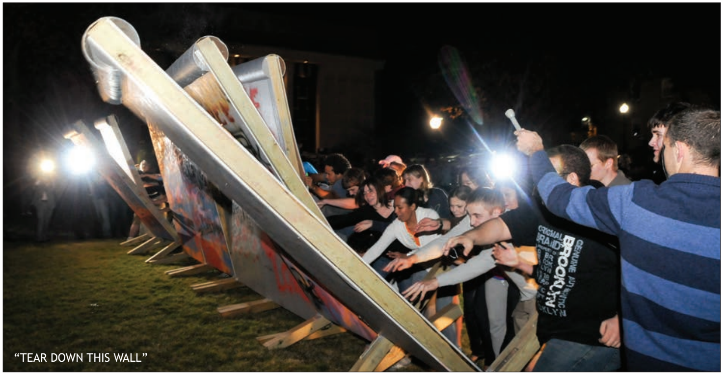
“TEAR DOWN THIS WALL”